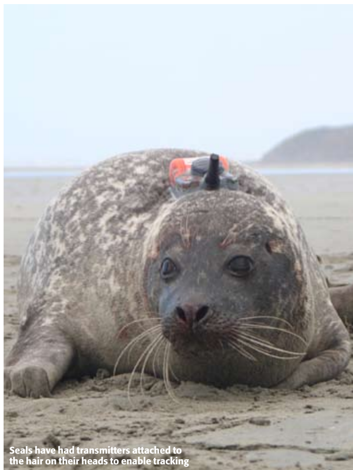
Seals have had transmitters attached to the hair on their heads to enable tracking

methods. So monitoring must continue – at test sites and at sea. The marine [energy] industry is not viable unless it can carry these costs.”