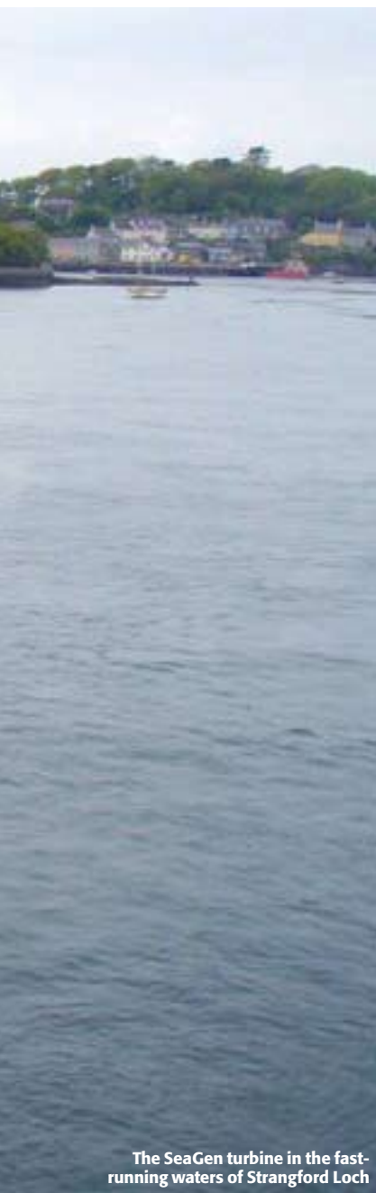
The SeaGen turbine in the fast-running waters of Strangford Loch